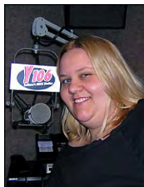
Tonya Haze Afternoons 3—7 pm